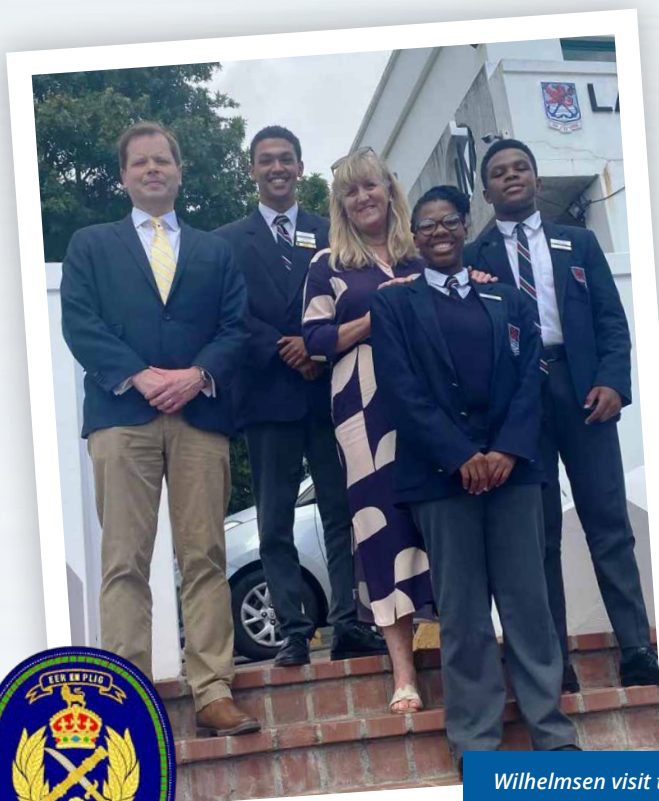
Wilhelmsen visit to LMC