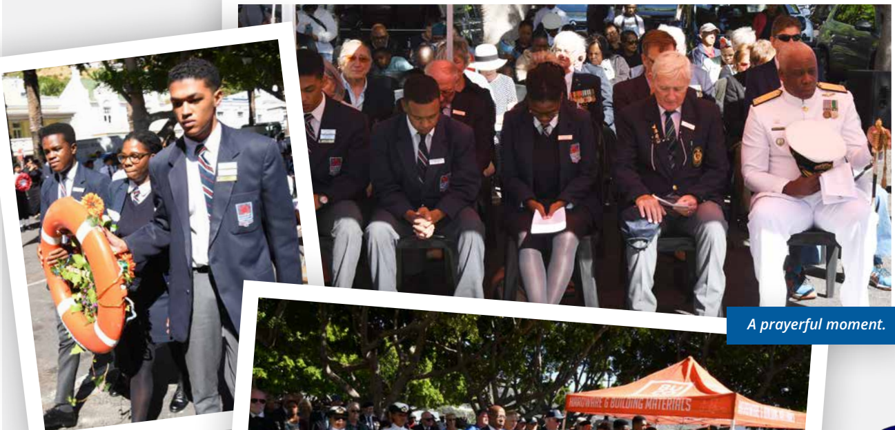
A prayerful moment.